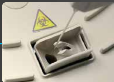
Waterfall probe cleaning