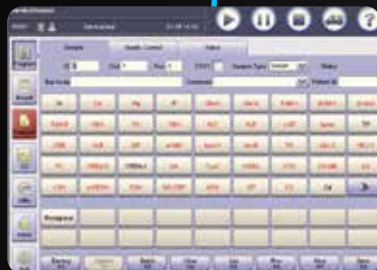
Intelligent software with user-friendly interface