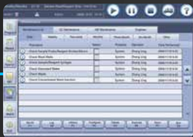
Step-by-step maintenance guide