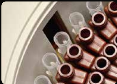
Built-in barcode reader