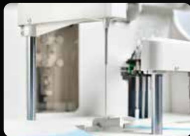
Independent mixing bar